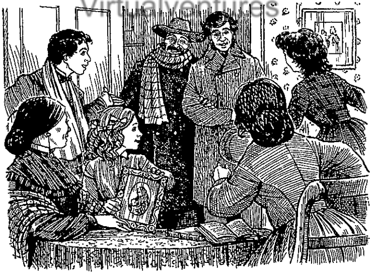
'Here's another Christmas present for the March family.'

Suddenly, the door to the other room opened, and there was Beth, running straight into her father's arms. There were tears of happiness on many faces before all the excitement died down. Then Mrs March thanked Mr Brooke for taking care of her husband, and he and Laurie left the family to themselves.