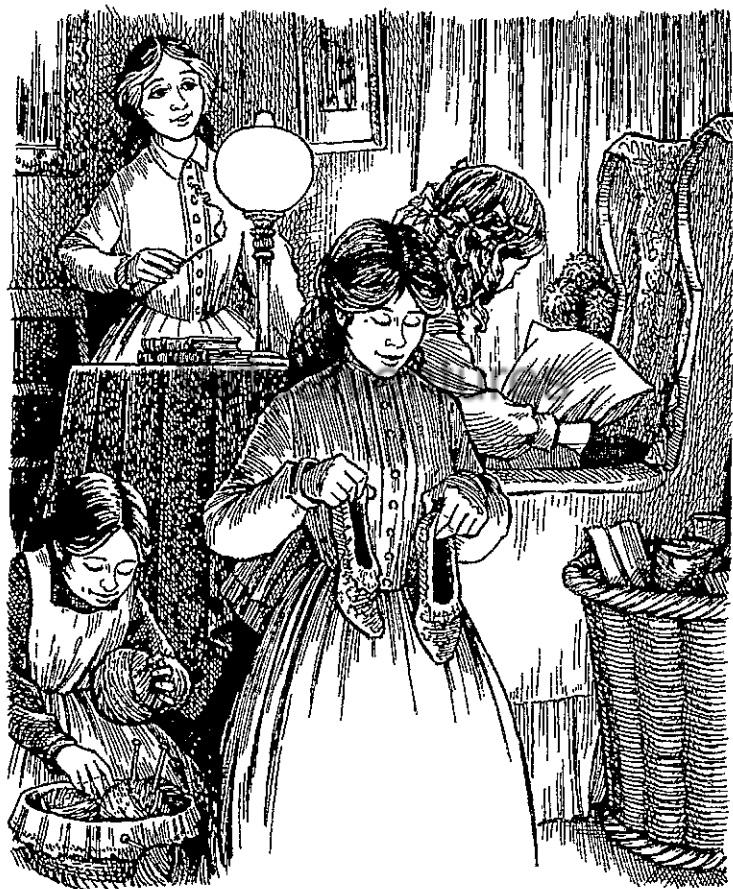
Jo held the slippers closer to the fire.

‘These are old,’ she said. ‘Mother needs a new pair.’