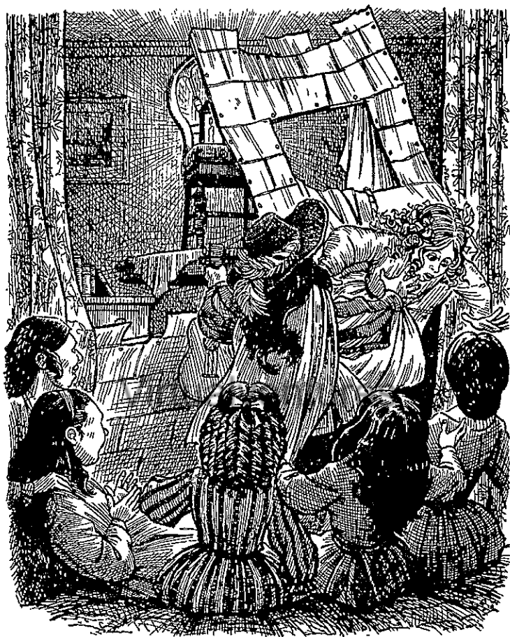
The castle fell down as Roderigo and Zara were escaping from it.