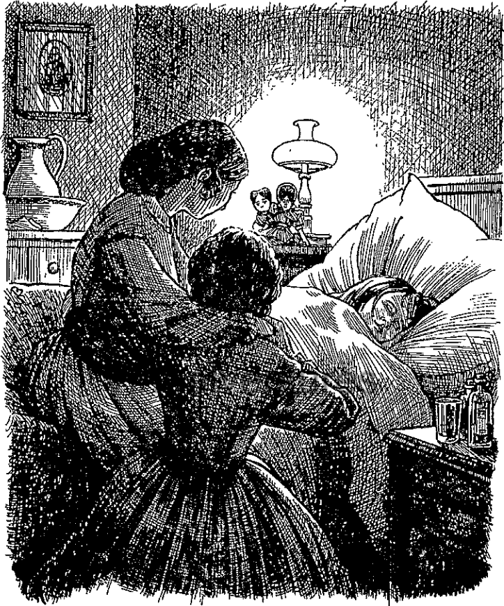
Meg and Jo held each other close.

Laurie went to give the good news to Amy at Aunt March's house. He, too, was tired after the long night, and just managed to finish telling his story before he fell asleep in the chair.