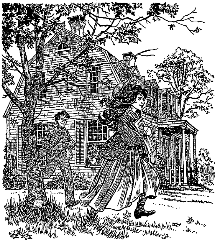
Meg saw Laurie chasing Jo all over the garden.

Two Saturdays after Jo had gone secretly into town, Meg saw Laurie chasing Jo all over the garden before the two of them fell on the grass, laughing and waving a newspaper.