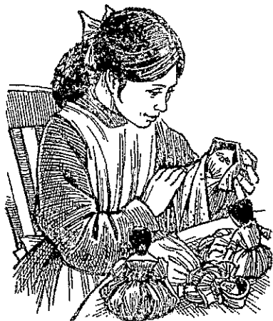
Beth spent hours alone, playing with her dolls.

Amy drew the most beautiful pictures and wanted to be a famous painter one day. She was a favourite with everyone, except when she complained about having to wear her cousin's old clothes because her mother could not afford to buy new ones for her.