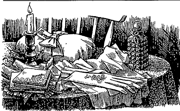
'A nice pair of gloves and some handkerchiefs.'

Amy hid her face on her mother's shoulder. 'I'm selfish,' she cried, 'but I'll try to be better.'